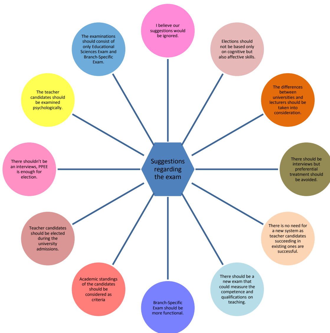
Figure 6. Participants' Suggestions Regarding the Exam

The participants were asked "How should the most successful candidates be selected to be appointed to a limited number of vacancies?" to present their suggestions regarding the exam. Distribution of participants' suggestions regarding the exam is indicated in Table 8.