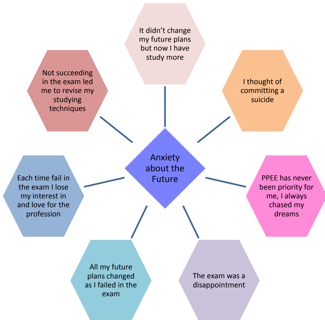
Figure 5. Participants' Future Plans

The participants were asked “What changes have it caused in future plans, not being successful in this exam?” to give details about their future plans. The remarks of the participants are indicated in Table 5. Distribution of participants’ future plans is indicated in Table 7.