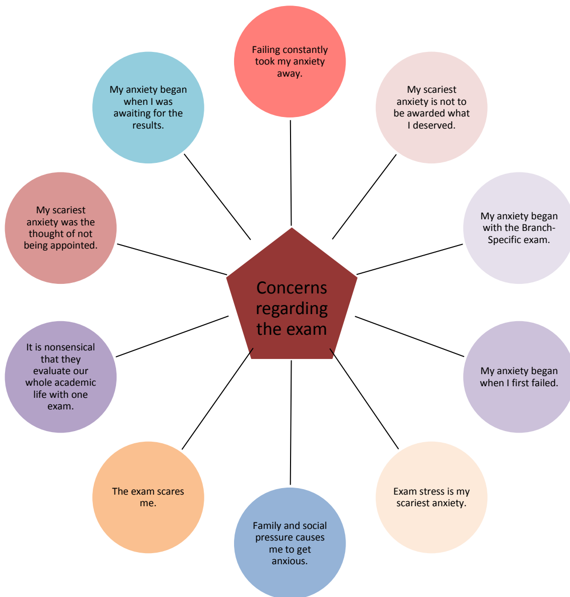
Figure 3. Participants' Concerns Regarding the Exam