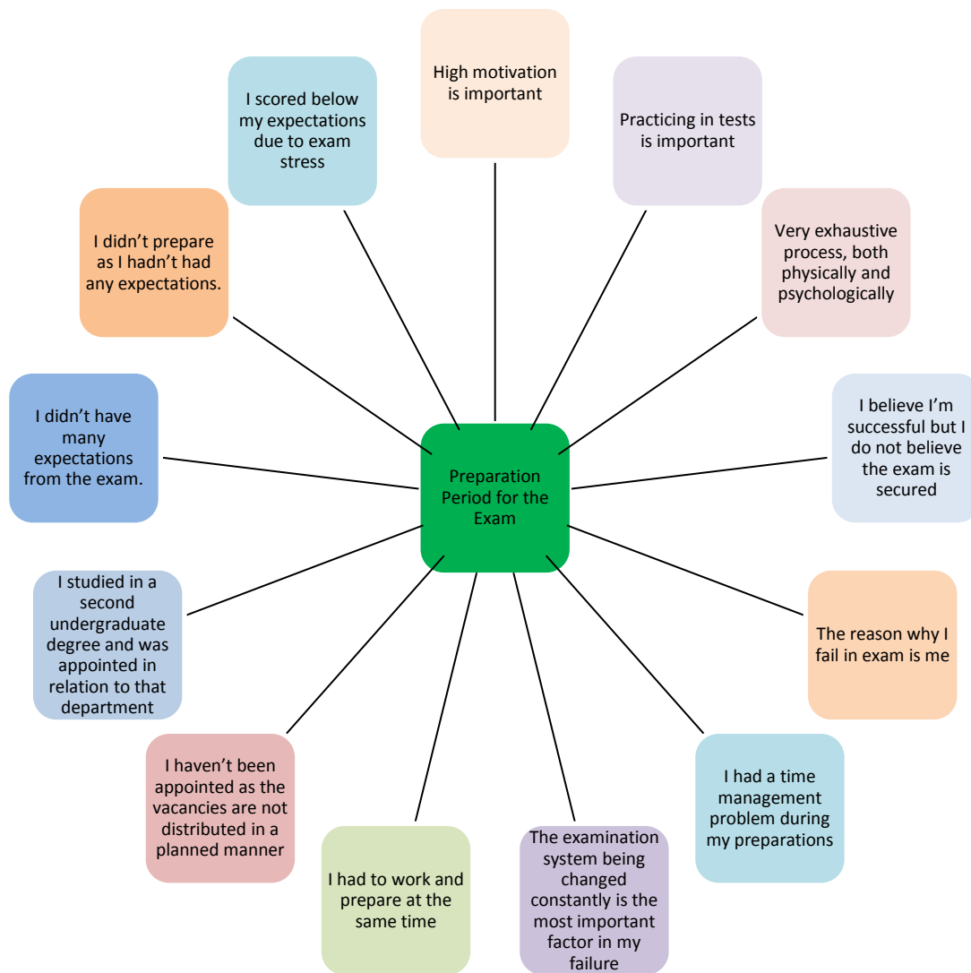
Figure 2. Participants’ Opinions on Preparation Period